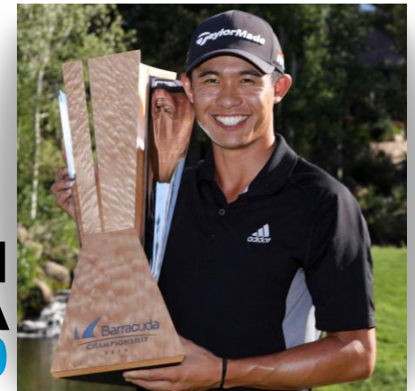
2023 | AKSHAY BHATIA