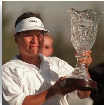
NOTAH BEGAY III 1999