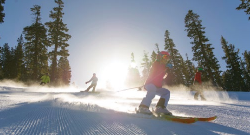
THE PAVILION AT OLD GREENWOOD